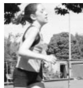
Sunday 22 October Traf Men's & Boys Wear Fun Run