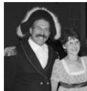
Friday 20th October Trafalgar Day Rotary Ball

The first day of an annual three-day golfing event for the Battle festival. $6.00 entry. Contact Larry: 5633 1110