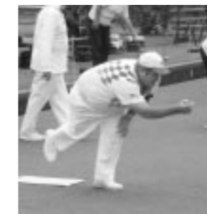
Wednesday 25th October Victoria Police Bowling Club Affiliate 4's

Indulge in Devonshire tea with scones cooked with secret ingredients in the wood-fired oven and/or beef and gravy rolls on the go. Cold drinks available.